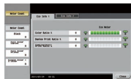
Eco Info (Eco Indicator) for toner/paper savings

The weekly timer, which rationally saves power when the bizhub is not in use, now includes a learning function. It intricately cuts power consumption by learning and adjusting the settings to real-time use.